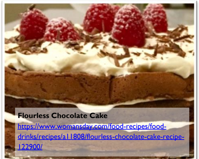
Flourless Chocolate Cake

Looking for new Passover dessert recipes? Click on the links below.