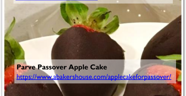
Parve Passover Apple Cake

https://www.delish.com/cooking/recipe-ideas/recipes/a52352/matzoh-icebox-cake/