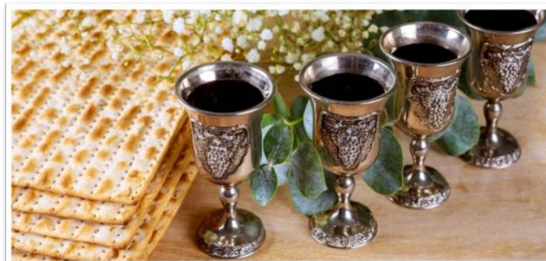
Matzah Icebox Cake

https://www.womansday.com/food-recipes/food-drinks/recipes/a11808/flourless-chocolate-cake-recipe-122900/